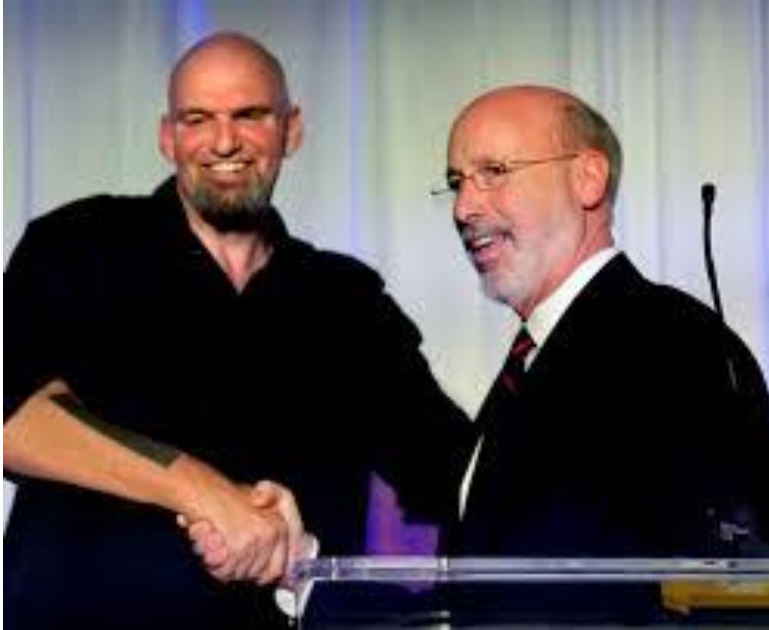
Congratulations, Governor Tom Wolf and Lt. Governor John Fetterman!