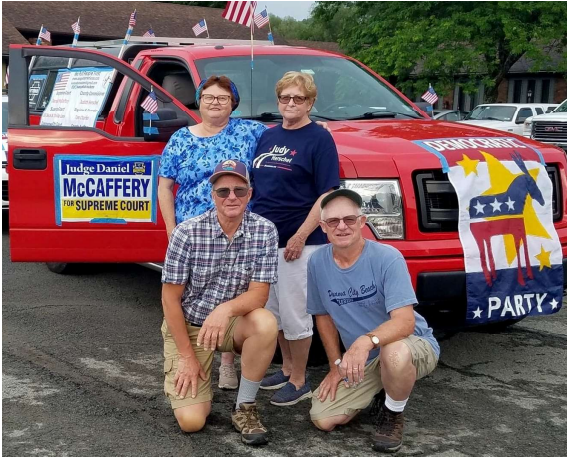
Dems at the Montrose parade on July 4 and the Clifford Parade on July 27.