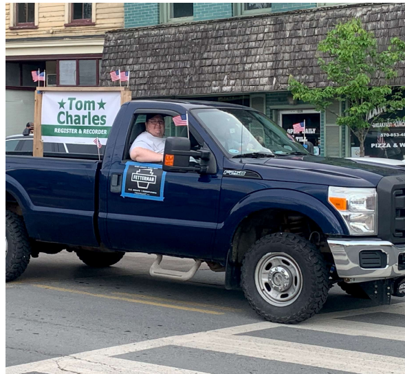
Dems participated in the Susquehanna Hometown Days Parade on July 14.