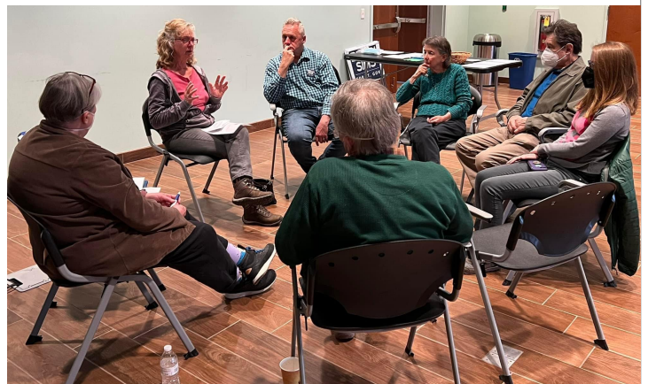
Photo from 2022 Issues Forum