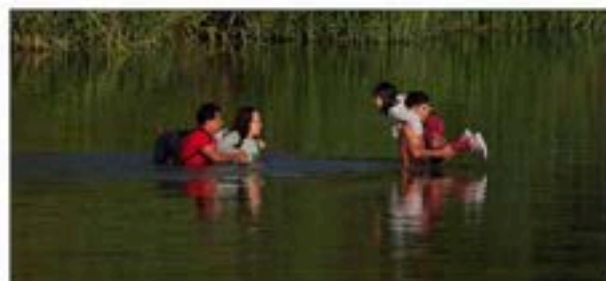
Migrants cross the Rio Grande and enter the U.S. from Mexico last October.

This legislation is a first step in securing our southern border. It combines both major policy changes with the resources necessary to enable DHS to implement and enforce those policy changes, some-