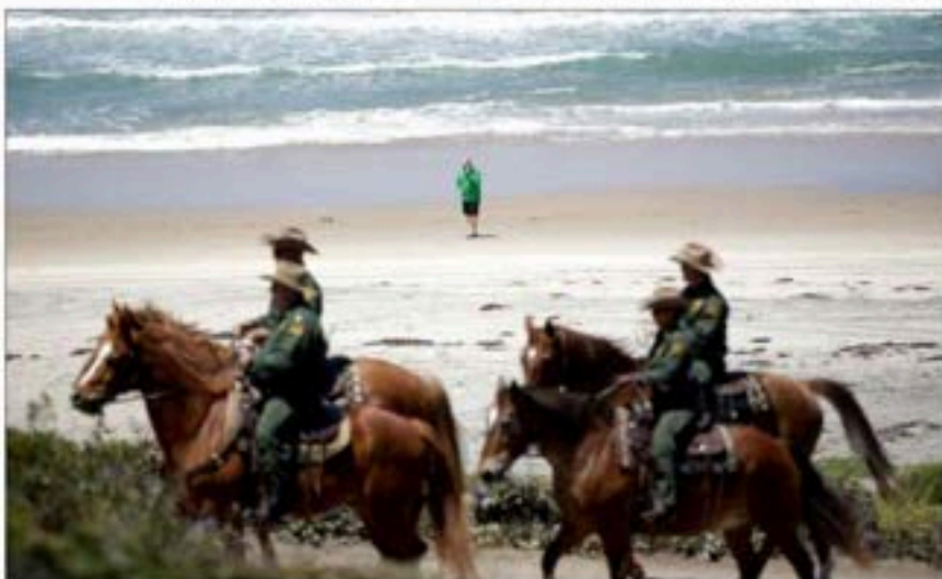
Border Patrol officers patrol near the border between San Diego and Tijuana, Mexico.

We deserve representatives who do the work. The people of the 9th District do better everyday, they take responsibility for themselves, their families and their work. We The People deserve elected officials who take responsibility for their work, stop playing politics with our lives and spend more time with their constituents than they do at their beach houses in Long Island.