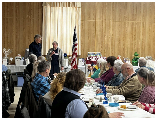
Petition Breakfast 2026